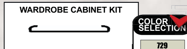
WARDROBE CABINET KIT