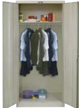
WARDROBE Model 835