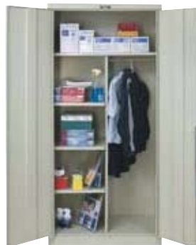
COMBINATION Model 855