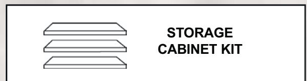
STORAGE CABINET KIT