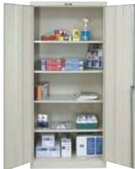
STORAGE Model 815

Includes full-height door stiffener. Doors swing a full 180°.