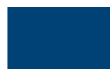
717 Grand Slam