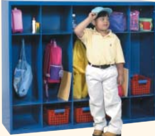
Primary II (5-wide unit)