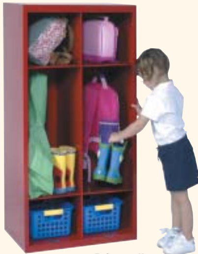
Primary II (2-wide unit)

Introducing Hallowell All-Welded Cubbies. We have engineered this new line of cubbies specifically for the elementary and early childhood school and daycare classrooms.