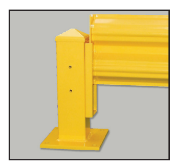
Lift-out rail adapter allows for access when needed