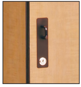
Built-In Key Cam Locks