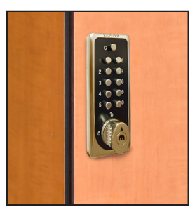
Mechanical Shared Use Locks