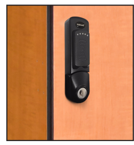
DigiTech™ RFID Electronic Locks