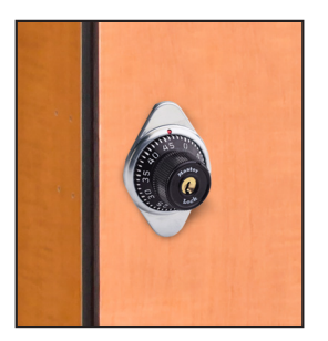
Built-In Combination Locks