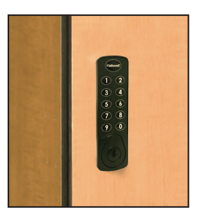
DigiTech™ H1 Electronic Locks