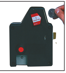
Coin or Token Locks