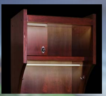
Optional LED Lighting under locker top and/or under shelf

Equip them with the industry's finest all-wood sport lockers. Recruiter™ custom wood sport lockers are made to order, and offer a variety of different options allowing you to tailor your locker room to your team's specific requirements.