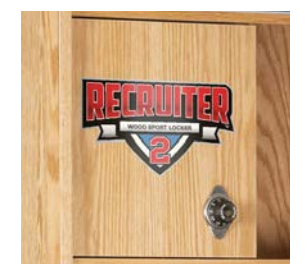
UV Full Color Print on security box door