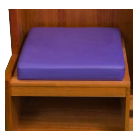
Padded Seat Cushion